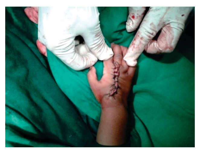
Fig.3: Excess Skin was Excised and Sutured